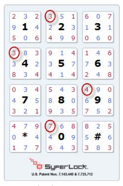
Figure 1: GridGuard Example

For more information about how Array Networks can help you provide secure remote, local and mobile access to your organization's data and applications, visit us at arraynetworks.com or send us an email at <a href="mailto:sales-info@arraynetworks.com">sales-info@arraynetworks.com</a>.